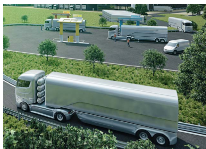
Bosch is a reliable partner for commercial vehicle workshops – and will be in future

Celebrating the 10 th anniversary of the Alltrucks commercial vehicle workshop concept, representatives of Alltrucks partner workshops, cooperation and service partners and the founding companies met in Fulda. Since its foundation, Alltrucks has been committed to continuous development. However, the focus in Fulda was not on the past but rather on current trends and the future of the workshop business. Several presentations addressed topics such as alternative drive technologies, remote diagnostics for commercial vehicles and legislative changes.