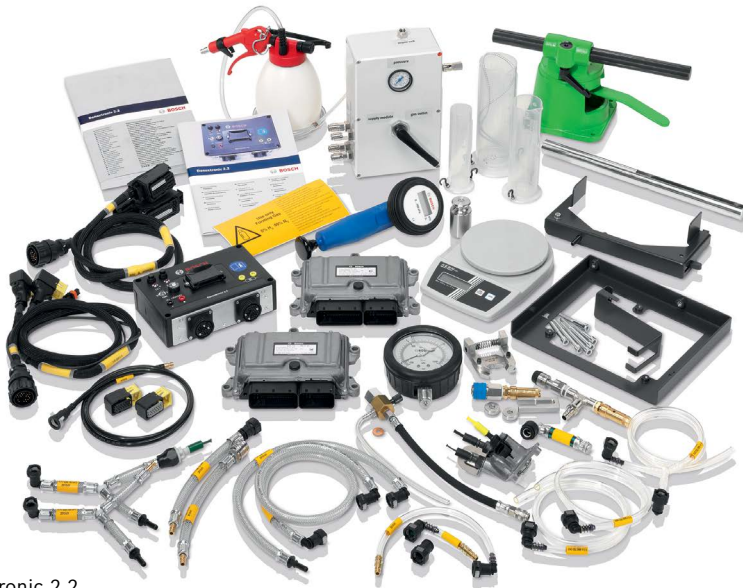
Denoxtronic 2.2 tool set

Around 18 million Denoxtronic systems are in operation worldwide – in trucks, construction and agricultural machinery as well as in stationary installations with diesel generators. Due to their high mileage, the need for service and demand for cost-effective repairs of Denoxtronic systems is increasing. These systems, which use Adblue to convert harmful nitrogen oxides (NOx), are important components of the exhaust-gas treatment due to increasingly stringent emission standards.