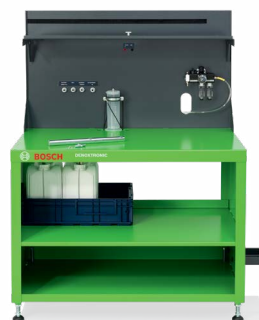
Bosch Denoxtronic workbench for all Denoxtronic maintenance tasks