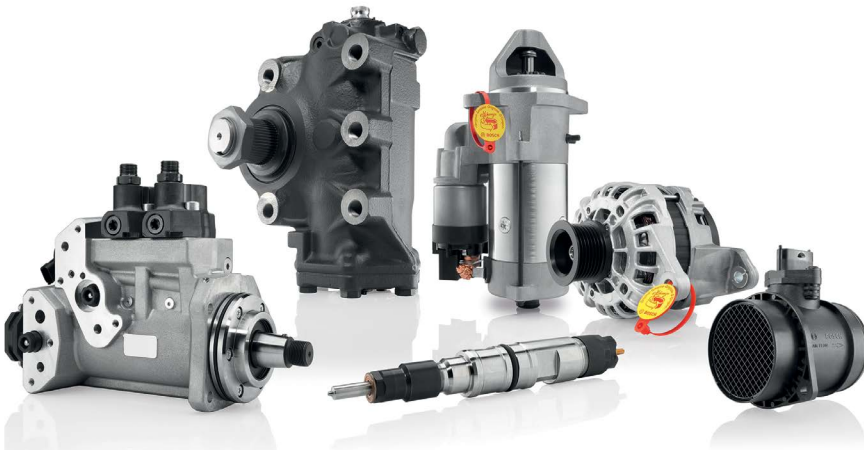
A selection of Bosch commercial vehicle parts are also available as Bosch eXchange parts.

For commercial-vehicle workshops, it is becoming increasingly important to consider a vehicle's age and therefore its fair value in relation to its purpose in the customer's fleet as a whole. Bosch eXchange offers a wide range of replacement parts for the repair of commercial vehicles in line with their current value. This supports commercial vehicle workshops to meet their customers' demand for high-quality, value-based vehicle repairs. Peter Lukassen, responsible for the operative sustainability at the Bosch Mobility Aftermarket division, answers questions about the sustainability strategy of Bosch eXchange.