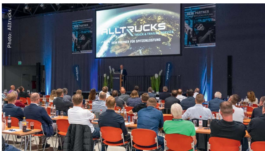
Around 700 Alltrucks partners offer multi-brand services for CVs in 16 European countries.

Celebrating the 10 th anniversary of the Alltrucks commercial vehicle workshop concept, representatives of Alltrucks partner workshops, cooperation and service partners and the founding companies met in Fulda. Since its foundation, Alltrucks has been committed to continuous development. However, the focus in Fulda was not on the past but rather on current trends and the future of the workshop business. Several presentations addressed topics such as alternative drive technologies, remote diagnostics for commercial vehicles and legislative changes.