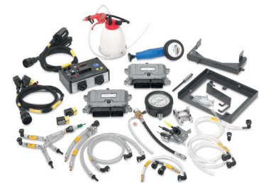
Denoxtronic 2.1 to 2.2 upgrade set

Depending on the age of the commercial vehicle, another cost-effective solution comes into play – removal and repair of defective Denoxtronic supply modules. For this purpose, Bosch provides the Denoxtronic 2.2 tool set and an Denoxtronic 2.1 to 2.2 upgrade set. All functional tests can be performed on the removed components by means of special tools including Bosch diagnostic equipment such as the KTS 560/590 and the tool sets. Diagnostic and repair instructions included in ESI[tronic] Evolution provide the required data for this purpose.