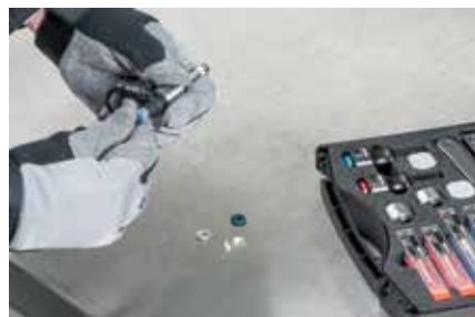
Assembly of the support washer and the O-ring

“Step-by-step” HDEV and HDP online removal and installation instruction