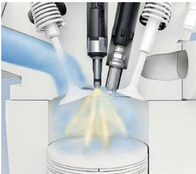
Precise composition and distribution of air and fuel

Detailed information on ultrasonic cleaning of high-pressure injection valves is part of the ESI[tronic] 2.0 Online.