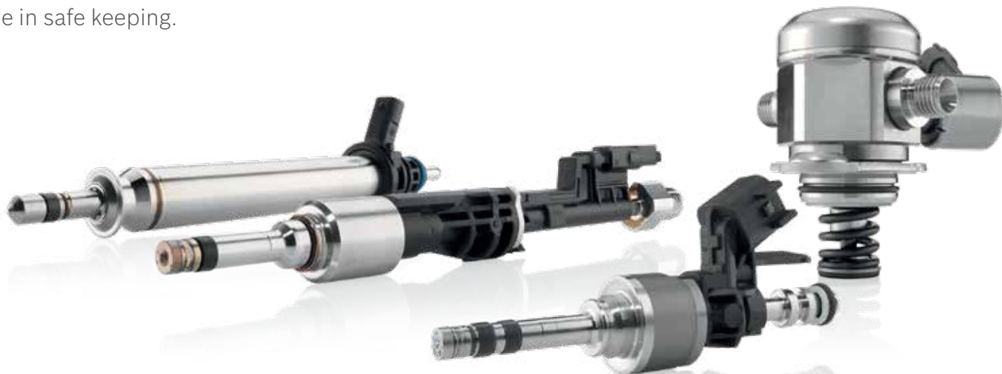
High-pressure injectors (HDEV4 piezo-controlled, HDEV5 long, HDEV6 short) and high-pressure pump (HDP)

High-pressure injectors and pumps are the key components of gasoline direct injection systems. For servicing and repairs, workshops can fully rely on Bosch spare parts – and be in safe keeping.