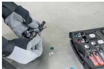
Disassembly of the O-ring and the support washer