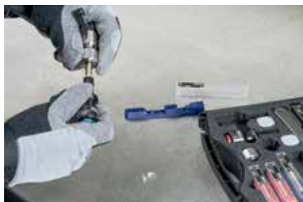
Winding up a new teflon ring