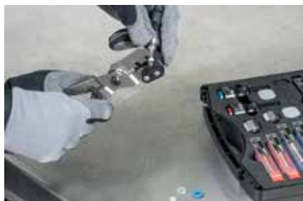
Disassembly of the teflon ring (combustion chamber sealing ring)