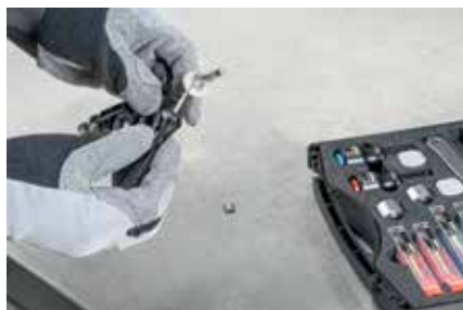
Disassembly of the decoupling element