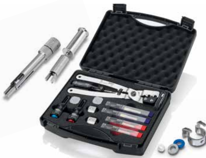
Special tool kit BTG 5120, extraction tools and spare parts