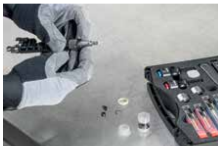
Assembly of the new decoupling element