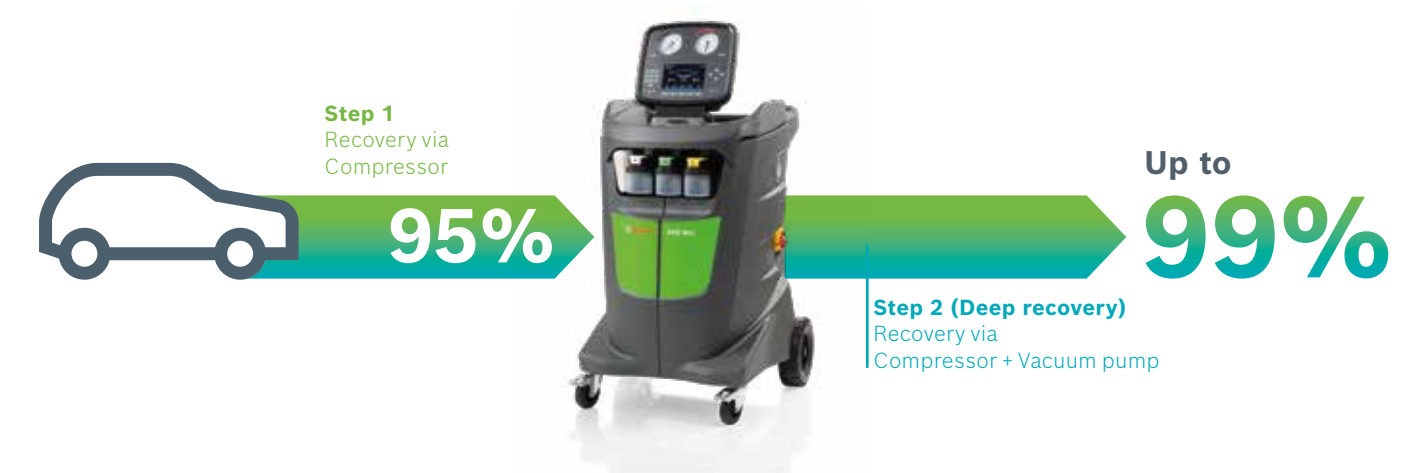
Figures depending on AC system specific configuration and operating conditions

Almost all vehicle manufacturers recommend specific service intervals for air conditioning systems. A/C service includes functional and visual inspection as well as refrigerant replacement. During the standard procedure, the compressor of the A/C service unit recovers the refrigerant and stores it at its own tank. In doing so, up to 95 % of