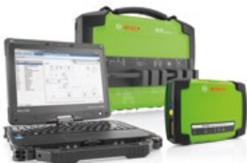
KTS 995: DCU 220 with KTS 560 und FSA 500

Robert Bosch GmbH Automotive Aftermarket