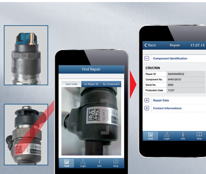
Use the QualityScan app to scan the code and gain access to component data