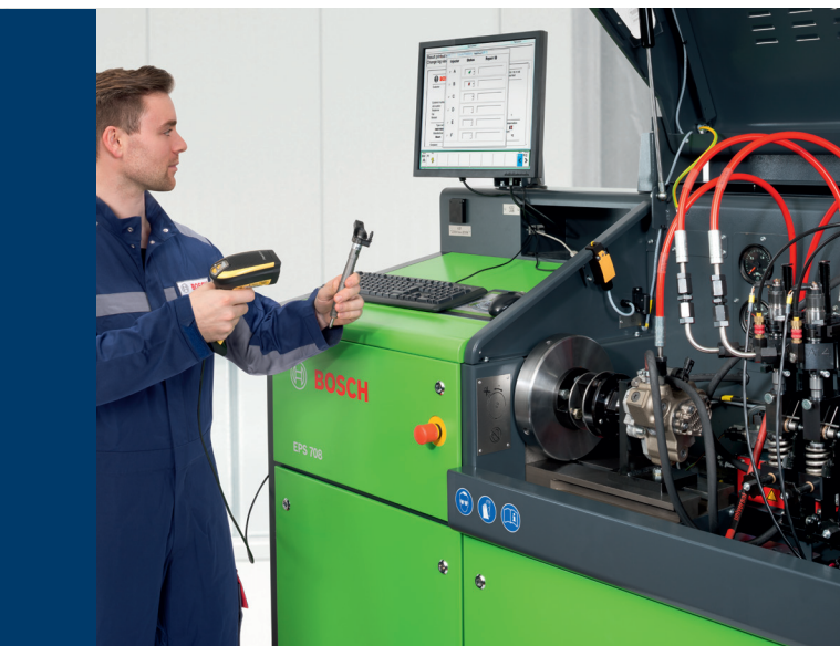
Your diesel specialist links the scanned component code to the testing result