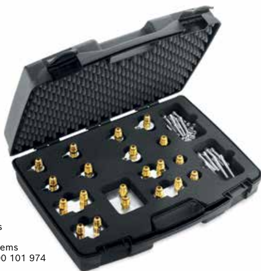
In a practical case: 15 flushing adapters for various different automotive A/C systems Order number: S P00 101 974

Performance losses of A/C systems are often caused by soiling resulting from abrasion or chips. This can even result in compressor defects. Thorough flushing is a great solution to remove remnants of refrigerator oil and soilings from the refrigerant circuit. At the same time, it protects all parts of the A/C system against possible damages. A/C flushing is also recommended when replacing A/C components such as e.g. the compressor. Not least, flushing is compulsory for