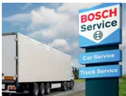
Bosch Service with Truck Service