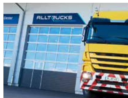
Alltrucks multi-brand workshop concept

of which Bosch is a founding member. At roughly 700 partner workshops, Alltrucks offers multi-brand services for commercial vehicles in Europe.