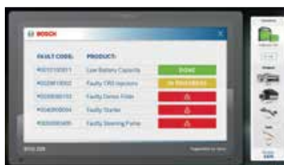
Error codes – shown on a virtual DCU 220

and spare parts, it is on the player to perform different service and repair tasks. Players score points they can