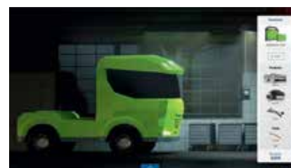
Slider menu as toolbox

Denoxtronic filters and a starter through to the installation of diesel injectors and a steering pump.