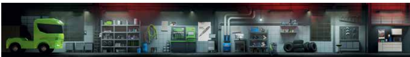
The complete workshop panorama of The Bosch Truck Escape