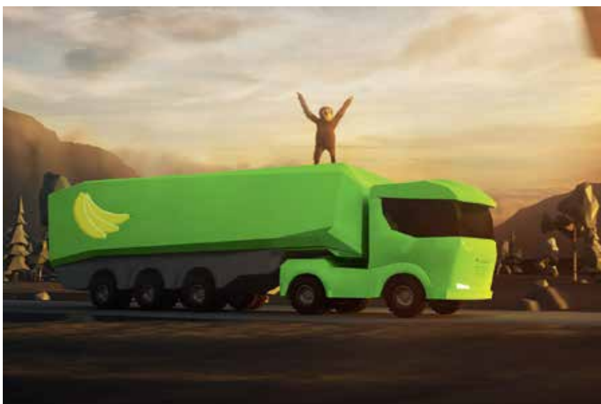
The Bosch Truck Escape

The Bosch Truck Escape is an online game developed to explain commercial-vehicle workshops the broad range of Bosch workshop equipment and spare parts in a playful manner.