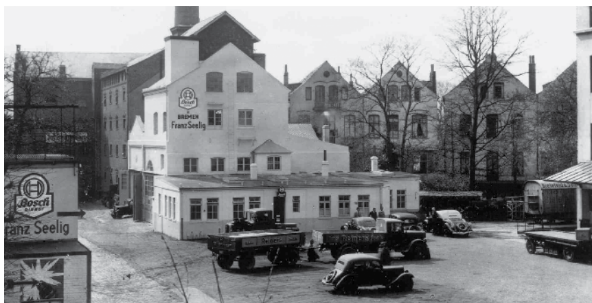
1939: Bosch Service Seelig in Bremen, Germany