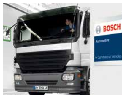
Bosch Commercial Vehicles module concept

Bosch makes it easy for commercial vehicle workshops willing to make use of the high Bosch expertise concerning test equipment and its broad range of spare parts. At the module concept Bosch Commercial Vehicles, the module partners benefit from Bosch test equipment, ESI[tronic] 2.0 Online workshop software, spare parts and a broad range of trainings. By means of appealing exterior signage and an extensive marketing and advertising package, the workshops exterior presentation is supported additionally and effectively.