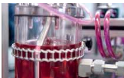
This film shows the filter production and laboratory test

At specific laboratory tests, water is added to the diesel fuel in order to determine the filters' water separation capacity. For its filter development, Bosch applies its complete injection system know-how. After all, the production of an ideal product requires know-how about the interaction of all components. Bosch filters are thus a perfect example for high quality down to the last detail.