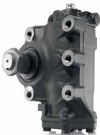
Hydraulic RB-Servocom steering system

200 products (part numbers) are available any time. This direct availability increases the workshops' potential to generate additional revenue. It allows short-dated replacement of steering systems at any time. This increases the customer satisfaction. After all, customers understand this workshop service as a particularly good one.