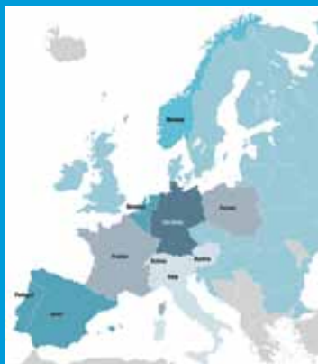
Alltrucks – expanding across Europe