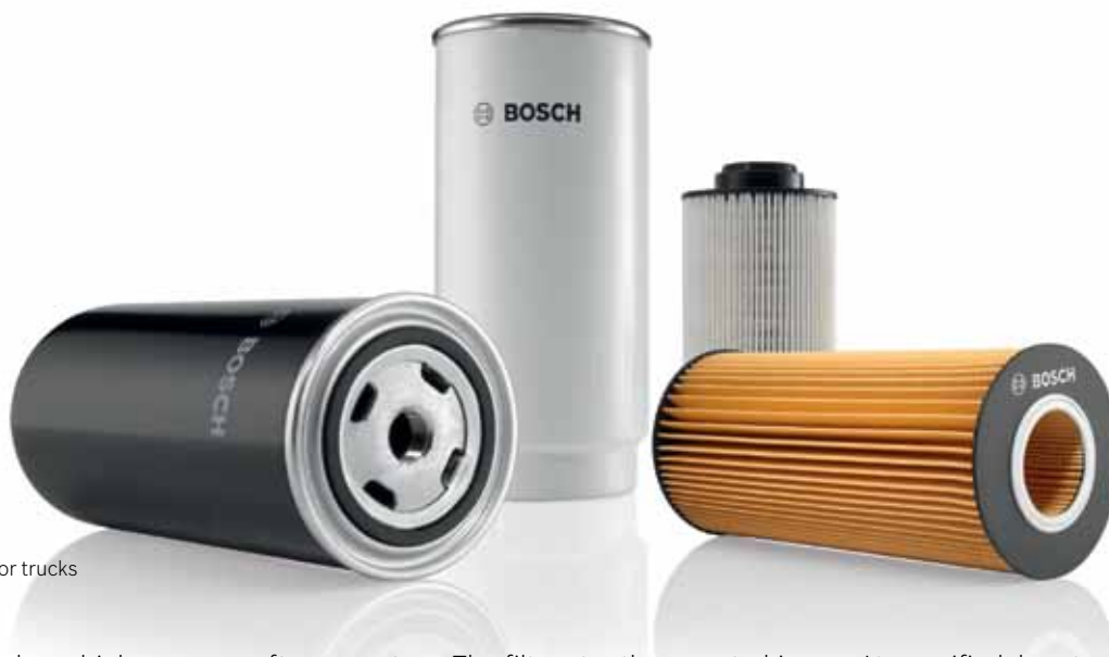
Bosch filters for trucks

Commercial vehicles are often equipped with modern engine systems featuring low tolerances. Therefore, filters are important for their protection. As one of the world's leading developers and manufacturers of injection system, Bosch expertise also influences its filter development. In this manner, Bosch filters reliably protect engine components against smallest dirt particles, abrasive particles and water.