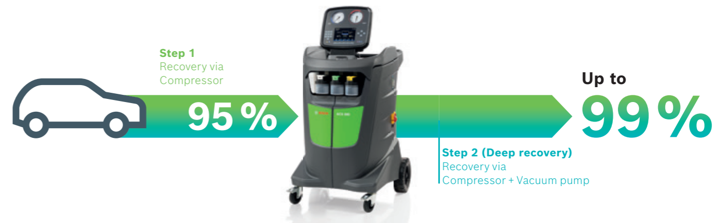
Figures depending on AC system specific configuration and operating conditions

the refrigerant is recovered in several steps. It is released through the venting outlet of the vacuum pump during the vacuum phase. Due to this particular loss of refrigerant, resulting in an increased environmental impact and a time-consuming procedure, an optimised function was developed: Deep Recovery.