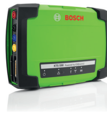
KTS 590 Wireless diagnostic module with measurement technology (2-channel multimeter and oscilloscope)