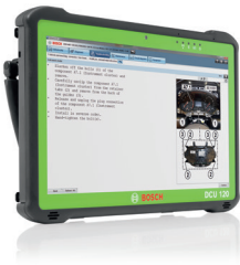
DCU 120 Mobile tablet PC with big screen