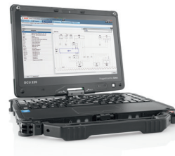
DCU 220 Flexible and powerful notebook and tablet PC in one