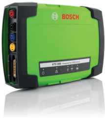
KTS 560 Wireless diagnostic module with measurement technology (1-channel multimeter)

Due to the ever-increasing number and complexity of vehicle systems, workshops must be able to draw on extensive knowledge. ESI[tronic] 2.0 Online and the diagnostic devices from Bosch work hand in hand to provide an optimally coordinated solution for the workshop.