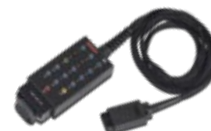
OBD adapter box with OBD interface