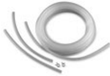
Silicon hose extension set for 2-stroke engines