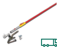
Clamping fixture with telescopic rod for BEA 070 (for commercial vehicles with an elevated exhaust)