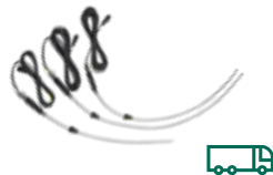
Temperature measurement probes also for commercial vehicle