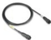
BEA 040 connection cable to BEA 030 and BEA 060