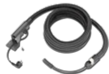
Heated exhaust gas sampling hose (BEA 070) for commercial-vehicle probe (5 m)