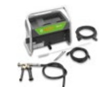
Diesel extension set for BEA 550 Otto