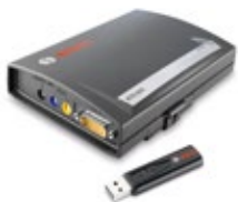
KTS 515 – OBD module