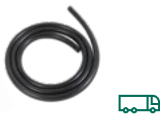
Exhaust gas sampling hose (BEA 070) for commercial-vehicle exhaust gas sampling probe (3.5 m)