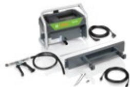
Diesel extension set for FSA 740