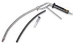
Gasoline passenger car exhaust gas sampling probe (part load up to 500 °C)