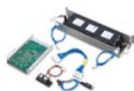
Battery extension set for BEA 070