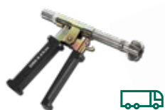
Commercial-vehicle exhaust gas sampling probe for BEA 070