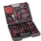
Test cable case