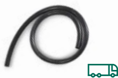
Exhaust gas sampling hose (BEA 070) for commercial-vehicle exhaust gas sampling probe (1 m)