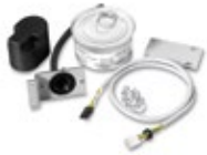
NO extension set