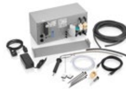
Four gas measuring extension set for FSA 740