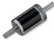
Active carbon filter