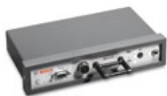
Rotational speed measurement module BEA 040