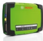
KTS 560 – control unit diagnosis with 1-channel multimeter