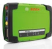
KTS 590 – control unit diagnosis with 2-channel multimeter/2-channel oscilloscope