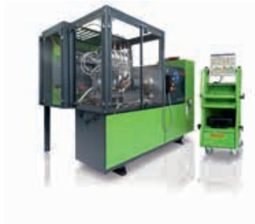
EPS 815, KMA 822: Universal diesel component testbench Only available until 06/2017