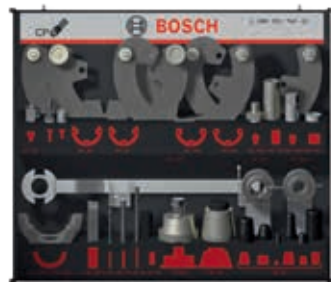
CP4 Tool board 2*