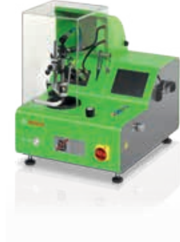
EPS 205: Quick and efficient work