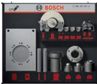
CP4 Tool board 1*

More than 125 years of expertise: next to competent service, Bosch provides you with high-quality tools for more efficient component repair.