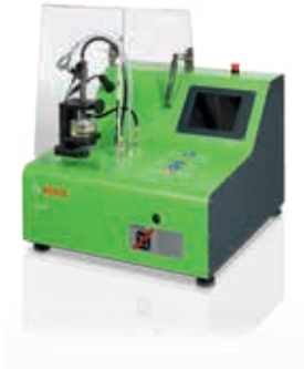
EPS 118: The injection tester for every workshop

Intuitive, precise and efficient: with Bosch as your partner you always have access to state-of-the-art and easy-to-learn test technology for the professional inspection of deinstalled diesel components.