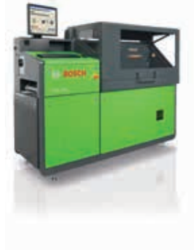
EPS 708: Specialised common rail testbench