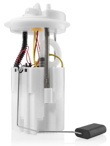
The fuel supply module is an integrated in-tank unit and contains all the components to deliver fuel to the engine.

Cellulose-based filter papers are used as the basis for filter production. These media are impregnated with a special resin that makes them particularly mechanically, thermally and chemically resilient. Depending on the application, an additional layer of fine plastic fibers is applied in a complex process. This enables even higher separation levels. When processing the filters, the quality standards of the original equipment are very high.