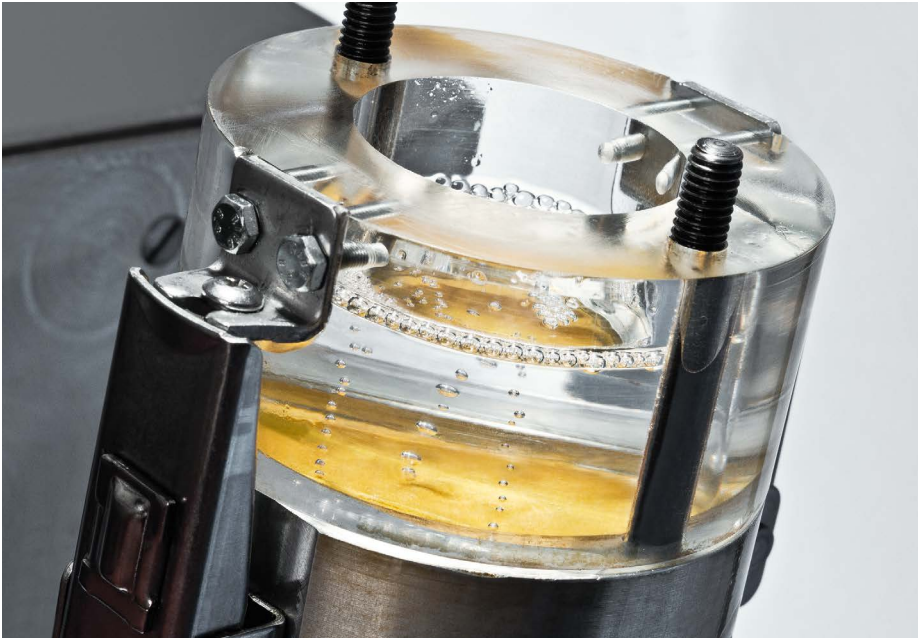
Measurement of the maximum pore size (DIN ISO 2942)

The filters must be sealed on the inside so that no unfiltered fuel can get into the injection system. Therefore, special attention is paid to the stable connection of the end folds of the filter medium during production. In addition, the connection between the filter element and the end caps ensures internal tightness and stability of the filter. To create these connections, special welding processes are used.