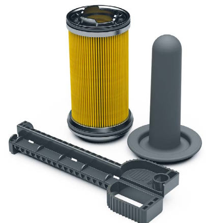
Denoxtronic filter with special tool

Denoxtronic filters clean the AdBlue®, which may contain particles that can clog or damage the injector valve. This protects the injection valve and ensures that the AdBlue® is dosed precisely. The right filter medium is crucial for the optimal function of the Denoxtronic filter.