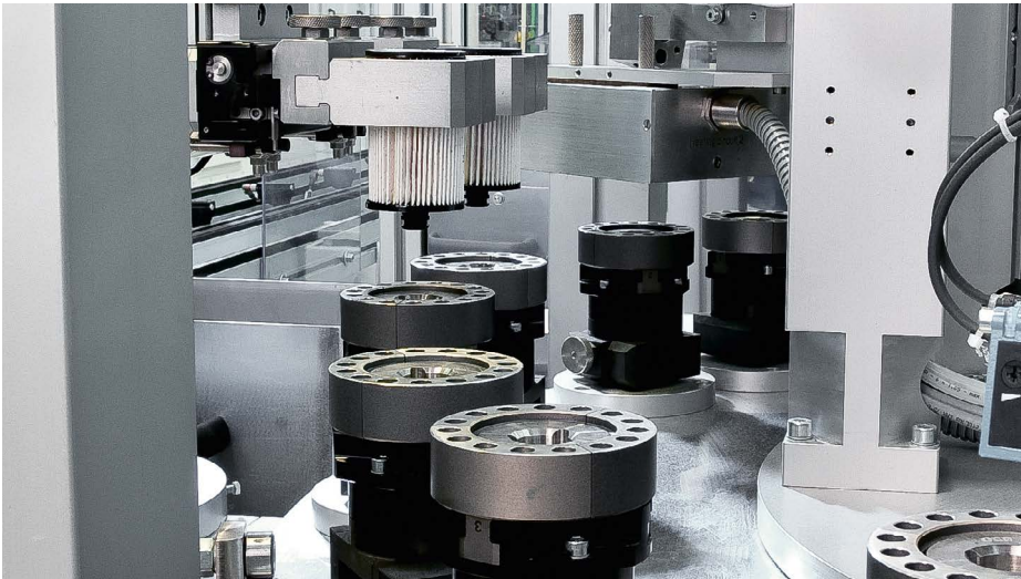
Connecting the plastic filter lid with a closed pleated-star by infrared welding

Modern gasoline direct injection systems work with high fuel pressures. Depending on the system, this can be up to 350 bar. Since contaminants can impair or interrupt the fuel supply, it is important to monitor the fuel specifically to keep it clean. This is ensured by a fuel filter integrated in the fuel supply module. This cleans the fuel over the entire lifespan of the vehicle and removes reliably finest particles. Bosch meets these high requirements and ensures the performance of the filters through various tests. Numerous vehicle manufacturers use Bosch fuel supply modules with built-in fuel filters as original equipment.