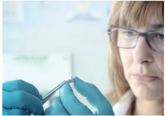
Bosch develops wiper blades in Bühl (Germany) and Tienen (Belgium)