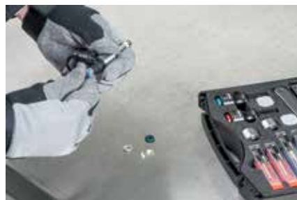
Assembly of the support washer and the O-ring

“Step-by-step” HDEV and HDP online removal and installation instruction