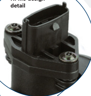
HFM5 design detail