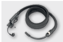
Heated (diesel) sampling hose for CV sampling probe (5 m)