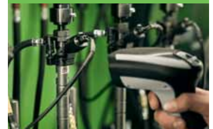
Bosch QualityScan makes the repair history transparent

The new Bosch DCI 700 injector test bench can be used to test older- and newer-generation Bosch injectors alike – including pressure-intensified commercial-vehicle technology and the VCC/NCC systems found in many vans. To check such injectors professionally, i.e. a fast measuring system with high measuring accuracy and the latest electronics are integrated in this modern injector test bench. It takes less than five minutes to mount and remove four injectors, with the test process taking an average of 15 minutes to complete.