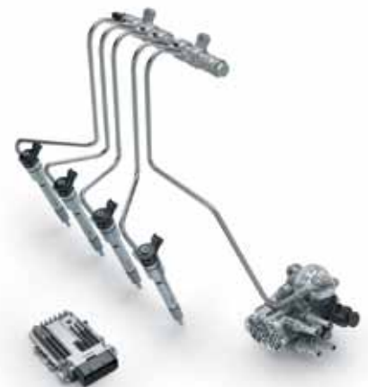
The CRSN2-OHW common-rail system – a special development for off-highway applications