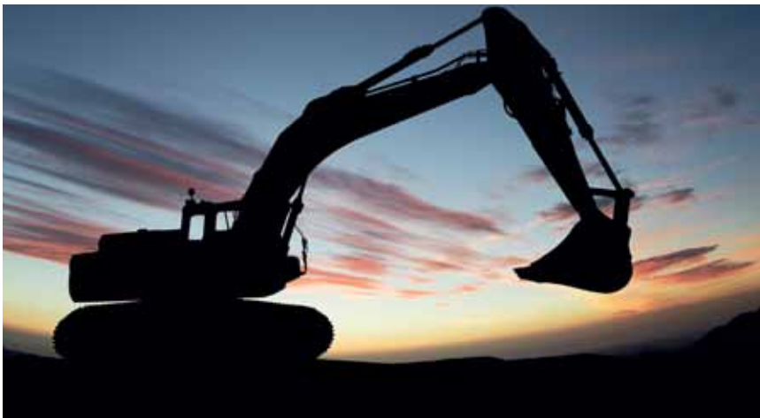
Excavators, caterpillar trucks, agricultural vehicles, speedboats, and emergency generators: The high performance of common-rail systems makes them a familiar feature in off-highway applications.

Common-rail systems for commercial vehicles ensure efficient fuel supply and injection in diesel engines. Many vehicles in off-highway (OHW) applications are equipped with these systems, from excavators, caterpillar trucks, and agricultural vehicles right through to speedboats and emergency generators. With various combinations of modules and system components, these are all brought to