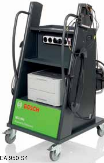
BEA 950 S4