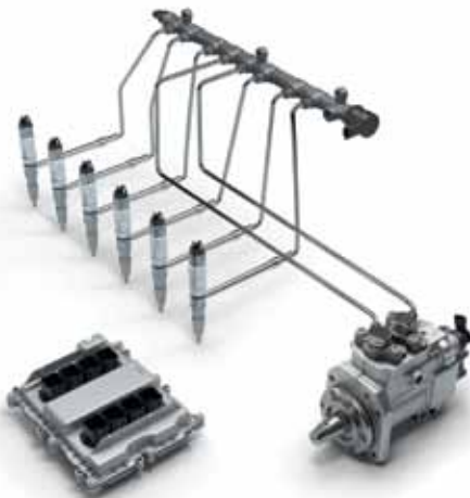
The modular CRSN common-rail system for medium- and heavy-duty commercial vehicles

The modular common-rail system is an advanced development of earlier CRSN systems. Its high-pressure pump generates system pressures of up to 2,500 bar. When required, the fuel stored in the rail is injected into the combustion chamber by the latest generation of injectors. Activation is the task of the engine control unit, which uses driver input and sensor signals to calculate and monitor the optimum operating state. The system can even be used in commercial vehicles with electrified powertrains. Its robust design facilitates up to 500,000 start/stop processes required for hybrid operation throughout the vehicle's service life.