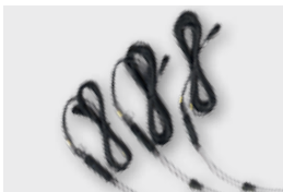
Temperature-measurement probes: Cable length: 6–10 m, Probe length: 1.5–2.1 m

Due to the dimensions of commercial vehicles, their exhaust tailpipes are often more difficult to reach. That is why Bosch offers special accessories that simplify exhaust-gas testing on commercial vehicles. These include temperature-measurement probes with cable lengths of up to ten meters, heated sampling hoses, and a clamping device with a telescopic rod that enables the opacimeter (diesel measurement module) to be used on commercial vehicles with vertical stacks.