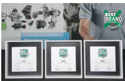
Page 7: Readers of WERKSTATT aktuell honor Bosch products with three “Best Brand” awards.