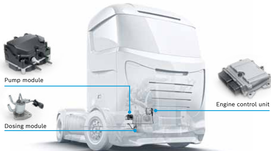
Denoxtronic for commercial vehicles – the full system from Bosch

Diesel engines comprise the main powertrain type in the transportation sector. This is not only true for long-haul operation in trucks and semitrailer tractor units: High-torque powertrains like this can also be found off-highway, such as in construction machinery or cranes. It is anticipated to take many