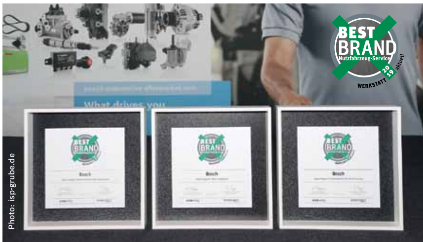
Bosch ahead of the pack with triple “Best Brand” honors