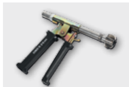
CV sampling probe for diesel