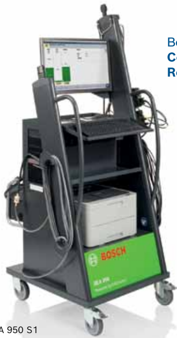
BEA 950 S1