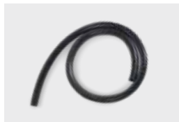
(Diesel) sampling hose for CV sampling probe (1 m)