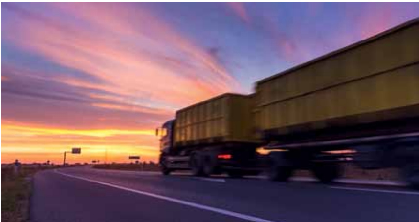
Whether at night, at dusk, or in poor visibility: Headlight bulbs ensure that you can see and be seen at all times.

Truckers are on the road all day and all night. Drivers need maximum concentration at all times, irrespective of whether the commercial vehicle in question is being driven on a highway, on a rural route, or to a depot in the inner city. Visibility on the road and a clear overview of surroundings must always be as close to perfect as possible. Otherwise, the commercial vehi-