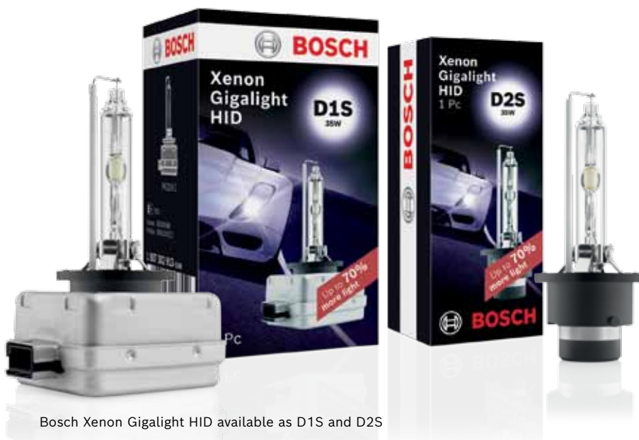
Bosch Xenon Gigalight HID available as D1S and D2S

cle cannot be driven safely. With regard to brightness and quality, Bosch Xenon Gigalight HID bulbs have been developed for the high demands of professional applications. Their longevity – which often lasts for the entire service life of the vehicle – is also crucial in day-to-day business. After all, a failed light can lead to costly downtimes or delivery delays.