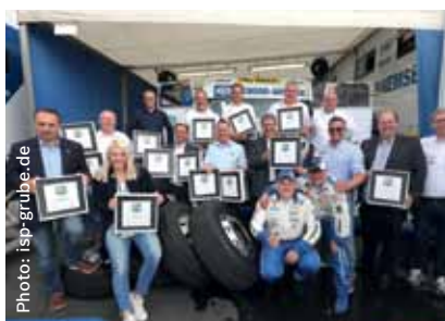
Worthy victors: the winners of the “Best Brand” awards

During the FIA Truck Racing Championship (ETRC) at the Nürburgring circuit, Bosch arranged an event for selected wholesalers and workshop customers. The portfolio of Bosch products for commercial vehicles comprising parts, diagnostic solutions, and services was presented amid pleasant summer weather. Guests also had the chance to witness Bosch’s dedication to motorsports – and get to know five-time ETRC champion, Jochen Hahn. A trip around the Nürburgring in a “racing taxi” was also thrown in. Participants were all impressed – the chance to experience Bosch products in racing mode is rare, after all.