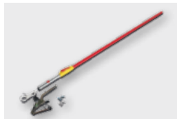
Clamping device with telescopic rod for diesel (for CVs with vertical exhaust stack)