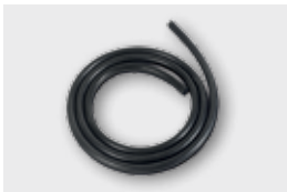
(Diesel) sampling hose for CV sampling probe (3.5 m)