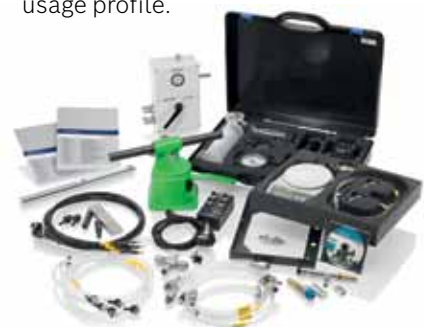
Denoxtronic 2.1 service kit

Workshops using Denoxtronic systems benefit from comprehensive support from Bosch. This makes repairs efficient and minimizes downtimes. In addition, Bosch testing technology opens up a variety of repair options. Components can be tested while still installed using the KTS Truck and the Denoxtronic 1 or 2 sets in a handy carry case. Functional tests help to identify the defective components. If the pump module or dosing module need to be replaced, the workshop can install new parts or remanufactured parts from Bosch eXchange, depending on the vehicle's current fair value. Alternatively, the component can be repaired after removal. This is where the Bosch Denoxtronic repair kits 1.1 and 2.1, or upgrade kits 1.1 – 2.1, come into play. These are used to perform functional tests and the recommended leak test. In such cases, the testing and repair manuals of ESI[tronic] 2.0 Online can be of assistance. What is more, practically oriented Bosch service training modules impart a broader knowledge of diesel technology, enabling workshops to render appropriate services for practically any vehicle age and usage profile.